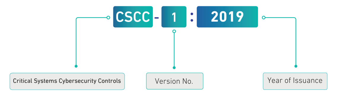
Figure 2. Controls Coding Scheme

Figures (2) and (3) below show the scheme and structure of CSCC codes.